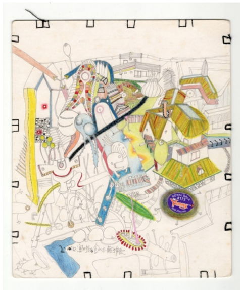
From the series New Zealand (2005-06)

Macau's art scene, with few commercially viable galleries, is supported with government funding—more than 50 are provided free of charge for exhibitions. Private enterprise also plays a key role in promoting and sustaining the city's unique cultural endeavours with its contribution to the development of non-gaming tourism in the territory. Indeed, Simple Things marks another step in the transformation of Taipa Village into a lively centre for the arts.