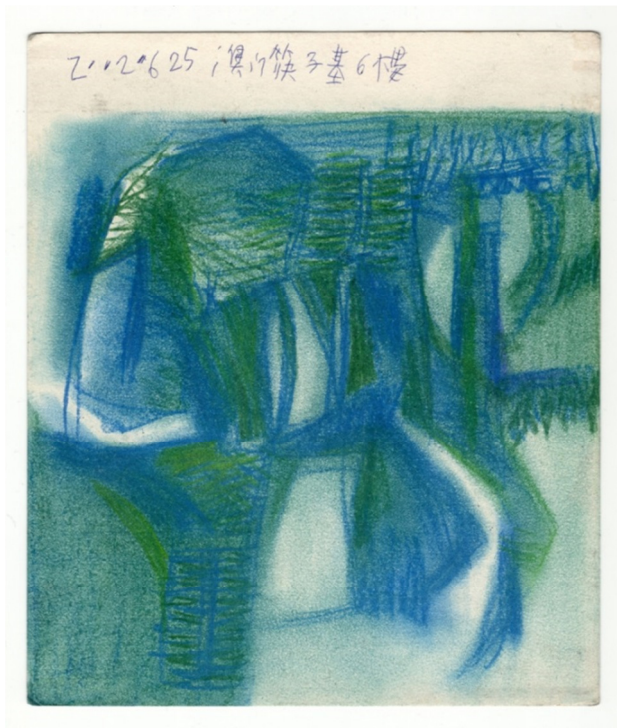
From the series Fai Chi Kei 6th Andar (2002)

While the art world in Asia is primarily market-driven, that of Macau is not really based on rankings or sales. The local art scene is, in a sense, at a more primitive stage, one where the focus is still on culture and how it contributes to society. While that makes it a difficult place for artists to survive, at the same time it does allow them to focus on creating good art. And that benefits the entire community.