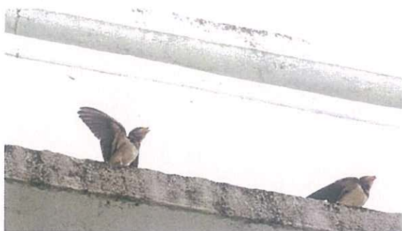
ECHO WITH WINGS