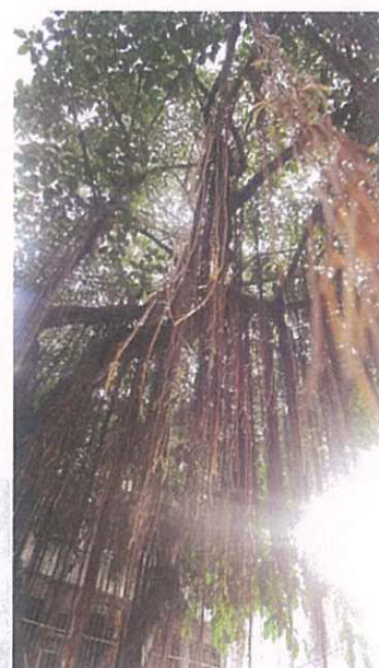
LOST IN FOREST