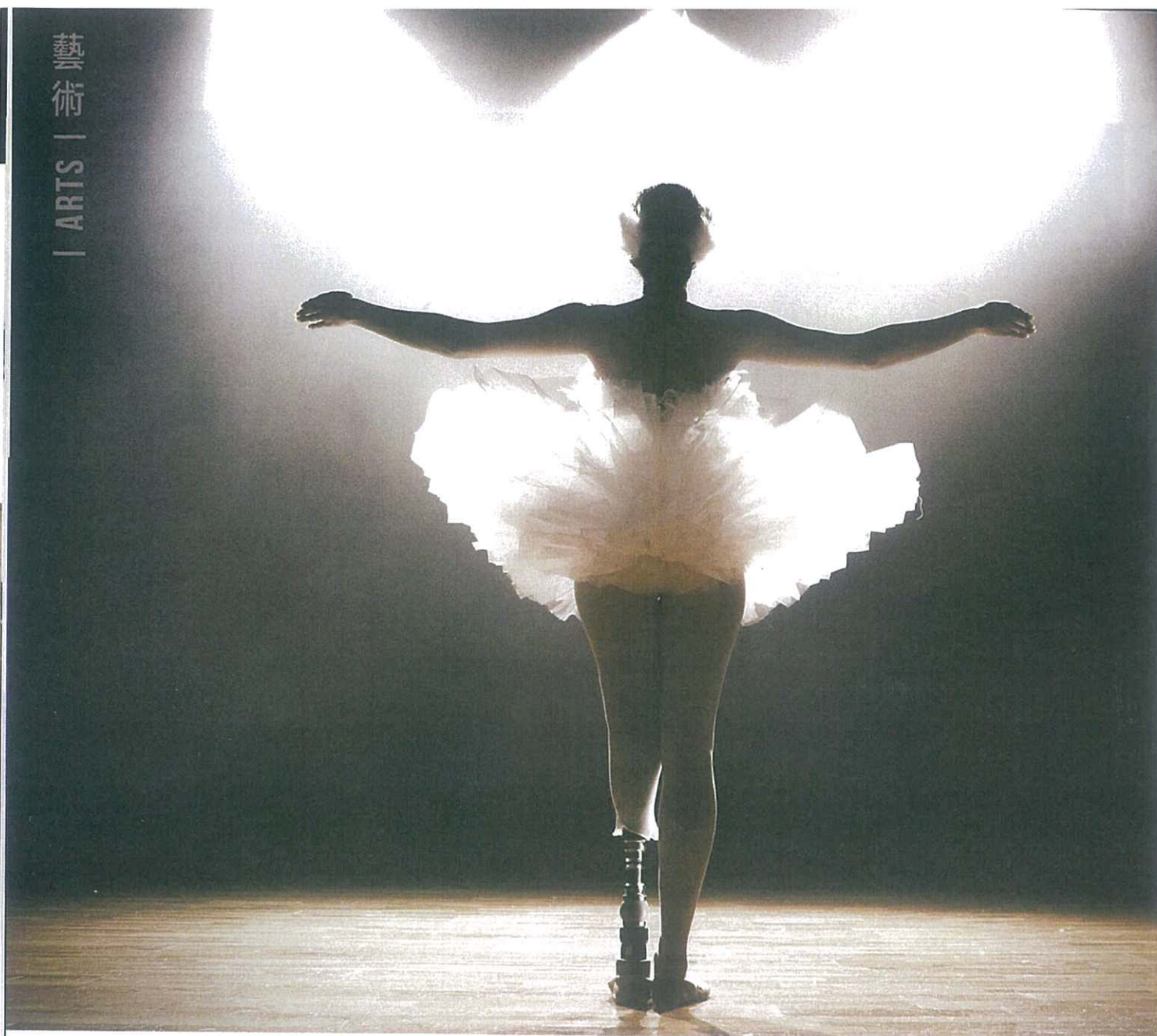
BLACK SWAN 黑天鹅 BY SEAN GOLDTHORPE