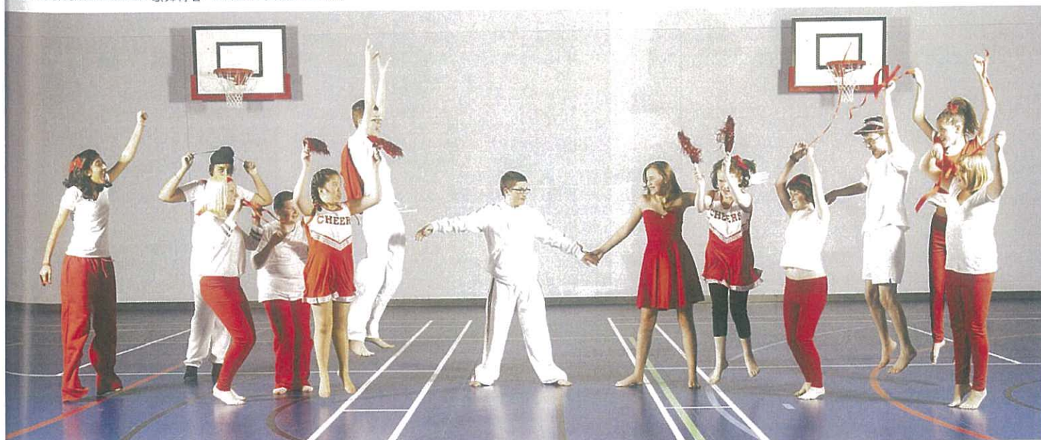
HIGH SCHOOL MUSICAL 歌舞青春 BY SEAN GOLDTHORPE

Alongside 11 Million Reasons will be two specially created local photography series – The Harmony Collection and The Dream Collection - unveiling the beauty and authenticity of disability art. The Harmony Collection captures the magical moments of the interaction between the local community, merchants, the underprivileged community and disabled during community events, through 10 joyful and touching images.