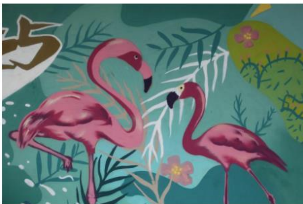
From pretty to funky, you'll find something that sparks your imagination.

Once your taste buds are satisfied, take bus No#33 (to Fai Chi Kei) and get off at Almeida Ribério. This area is famous for the ruins of St Paul's and the colourful, geometric patterns covering the buildings in Calçada do Amparo, but keep walking and you'll reach the Patio De Chon Sau. Here, you'll meet a cow, a kindly man and a rainbow-coloured zebra – art installations that have taken up permanent residence there. As well as these fun sculptures, the walls of the street are sprayed with graffiti art.