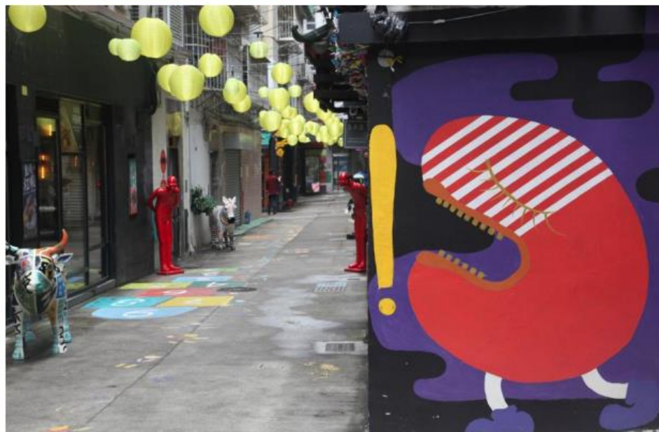
There is art by both local and international artists.